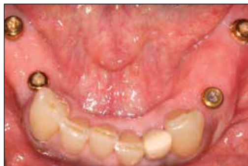
Figure 5. The mandibular occlusal view, showing locators in the posterior region, along with implant No. 23.

Maxillary overdentures and mandibular partial dentures supported by implants can be successful treatment modalities for patients who smoke and have compromised immune systems. The success of any prosthetic device depends on whether it is conducive to