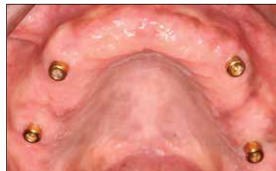
Figure 6. The maxillary occlusal view, showing implant positions along with a healthy and adequate width of alveolar ridge.

self-performed, effective oral hygiene with minimal effort. There are multiple advantages to using removable rather than fixed appliances to replace missing teeth, including ease of use. 12 The patient was 60 years old when he presented in 2015. Dexterity does not improve with age, and removable prostheses are easier for patients to maintain at home than fixed prostheses. Removable prostheses meet the challenge of aesthetic requirements by patients better than fixed prostheses because they replace hard and soft tissue, unlike fixed prostheses,