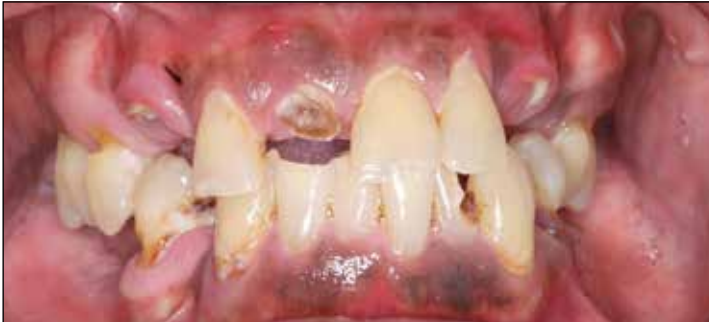
Figure 1. The frontal view, disclosing the severity of the patient's compromised oral health.