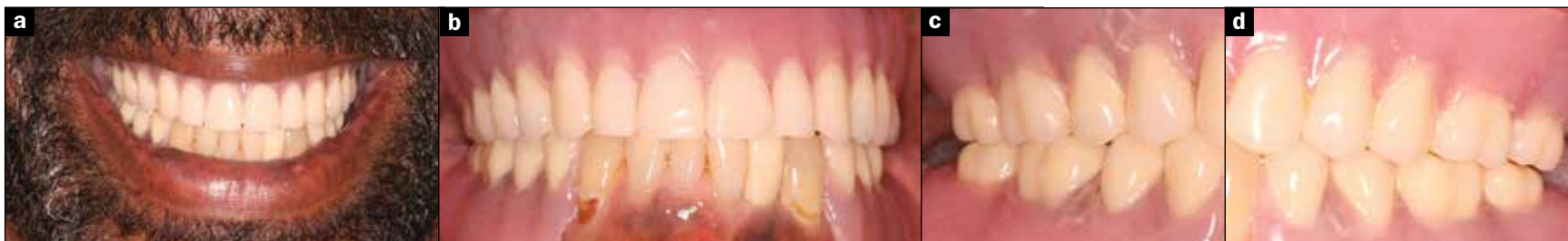
Figure 4. (a) The patient, smiling 3 years after successful treatment. (b) The frontal view (a non-carious cervical lesion was observed on the lower canines). (c) The right lateral view. (d) The left lateral view.

treatment. He smiles frequently and feels good about himself and the dentist who facilitated this positive outcome.